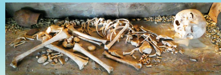
The Aymestrey Burial - The burial of a child from the Beaker culture dates from around 4000 years ago.