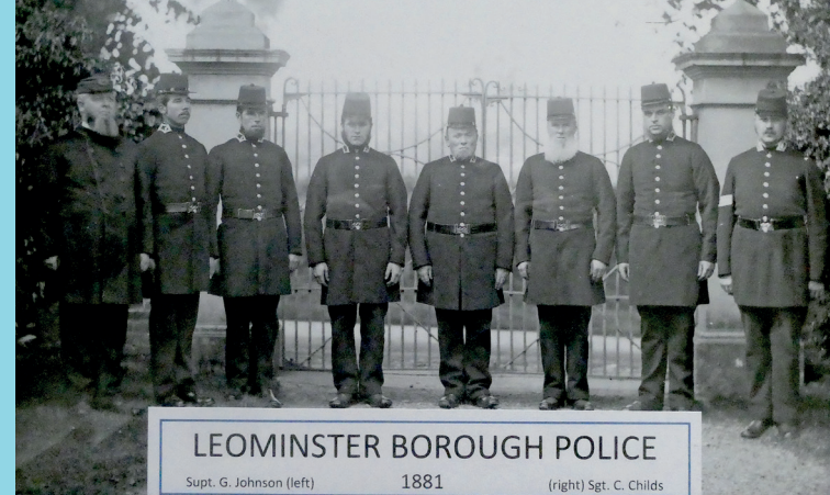
LEOMINSTER BOROUGH POLICE